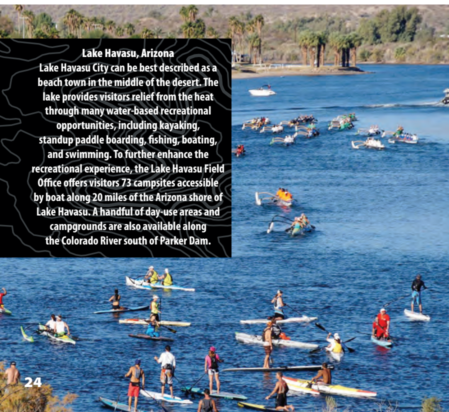
Upper Missouri River Breaks National Monument, Montana

Collect and analyze data to support decisionmaking in the public and private sectors and allow the Federal Government to better measure the effectiveness of its efforts to increase travel and tourism.